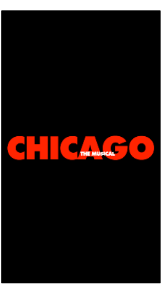
August 4 – 16, 2020